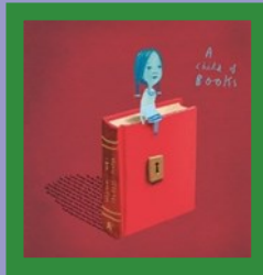
A Child of Books Oliver Jeffers