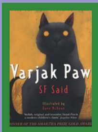
Varjak Paw SF Said