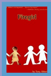
Firegirl Tony Abbott

Please join me in supporting HOWARD COMMUNITY PRIMARY SCHOOL PTA on #easyfundraising; you'll raise FREE donations with your everyday shopping. It's quick and easy to sign up! Plus, once you've raised your first £5, easyfundraising will double it! Sign up now: