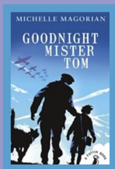
Goodnight Mister Tom Michelle Magorian